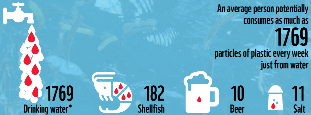
Figure 2: Estimated microplastics ingested through consumption of common foods and beverages (particles (0-1mm) per week)

* Drinking water includes both tap and bottled water